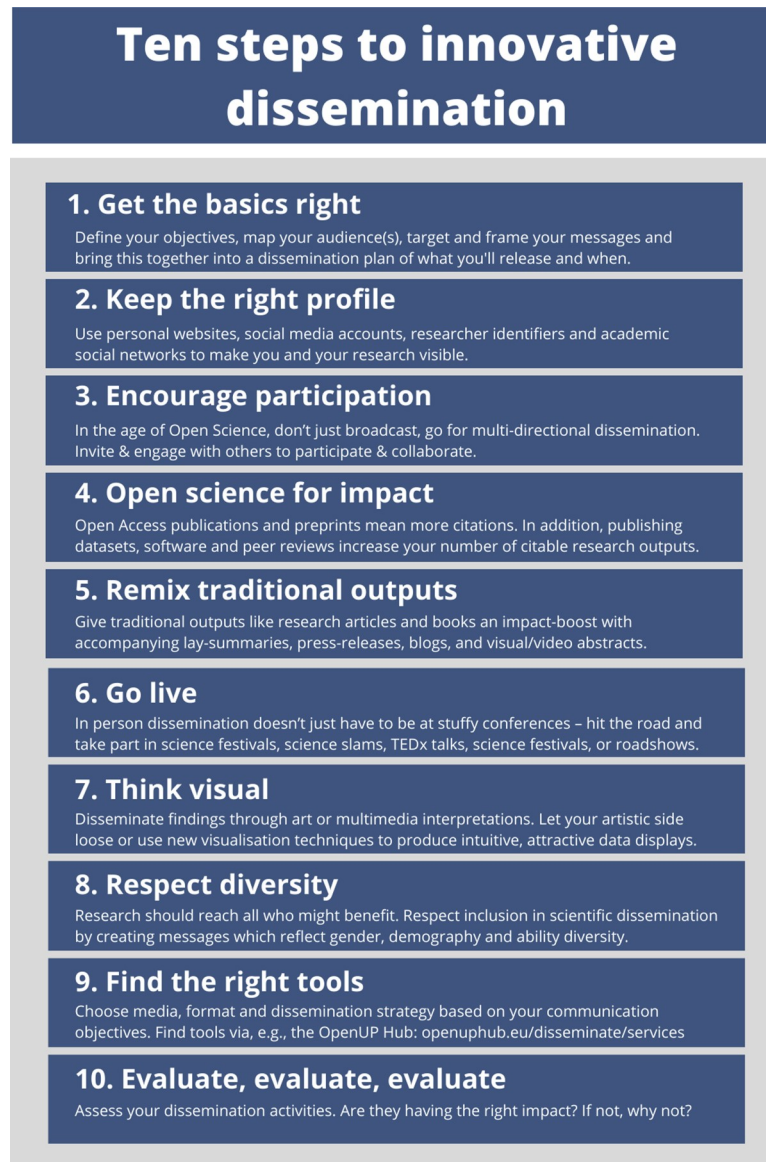
Fig 1. Summary of the 10 simple rules presented in this paper.

https://doi.org/10.1371/journal.pcbi.1007704.g001